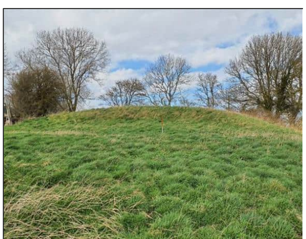
Plate 11: Earthworks according with HER reference MLI41778 – possible disturbed mound outside of the segment