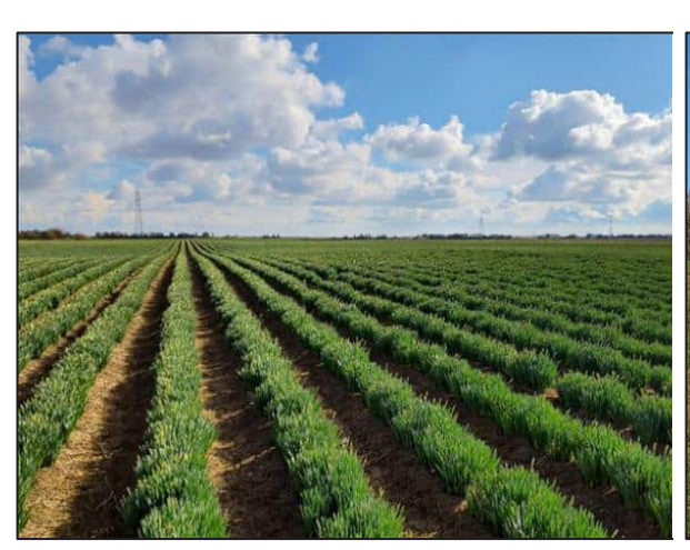
Plate 15: LiDAR feature 46 – possible mound