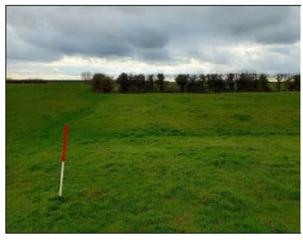
Plate 5 Earthworks at Slackholme (MLI99418)