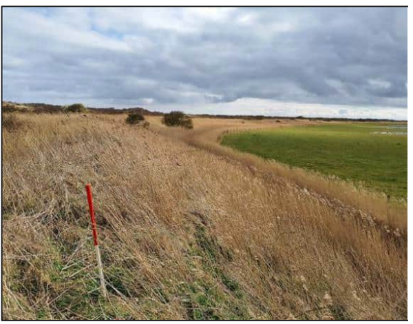
Plate 2: Landform to the east of the Roman Bank