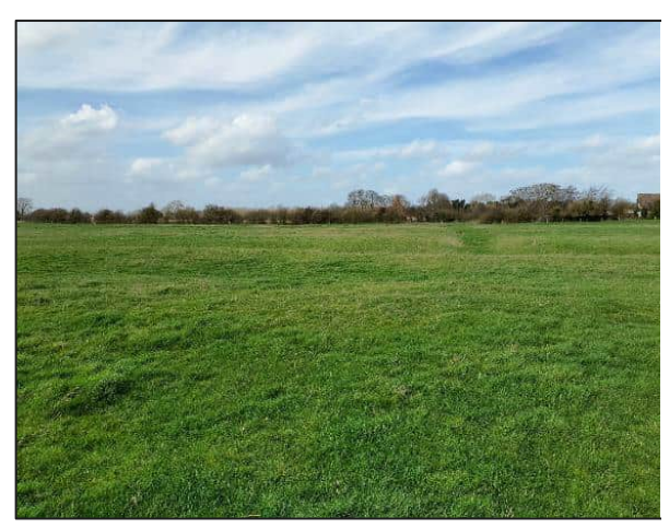
Plate 9: Ridge and furrow to the south of Croft