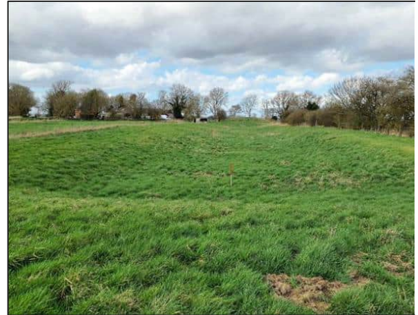
Plate 12: Earthworks according with HER reference MLI41778 – pond extending into the segment