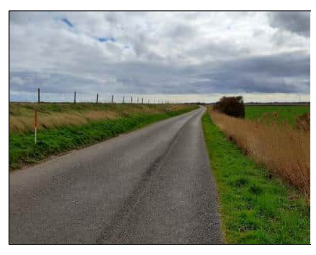
Plate 1: Sea wall – HER Reference MLI88782