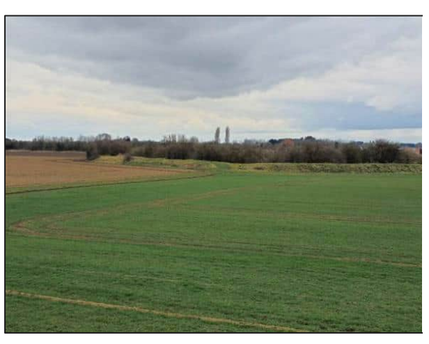
Plate 18: Sea wall intersecting ECC13