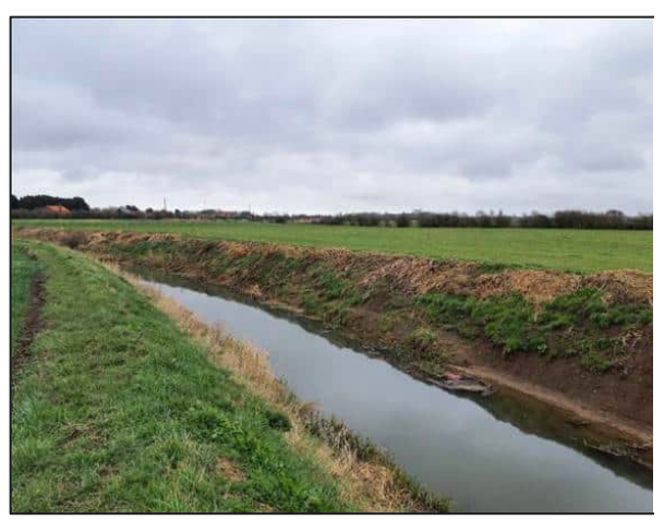
Plate 3 Willoughby High Drain