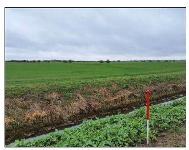
Plate 7 Curvilinear differential growth at potential medieval enclosure (MLI98636)