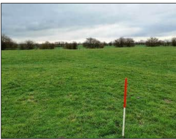
Plate 4 Earthworks at Slackholme (MLI99418)