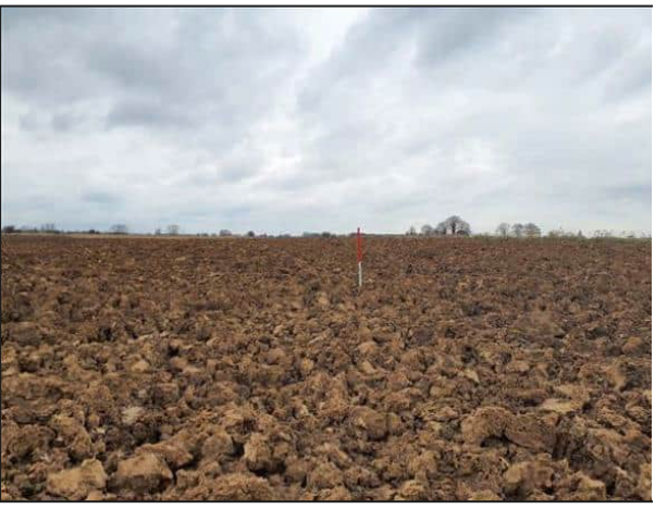
Plate 20: LiDAR feature 57