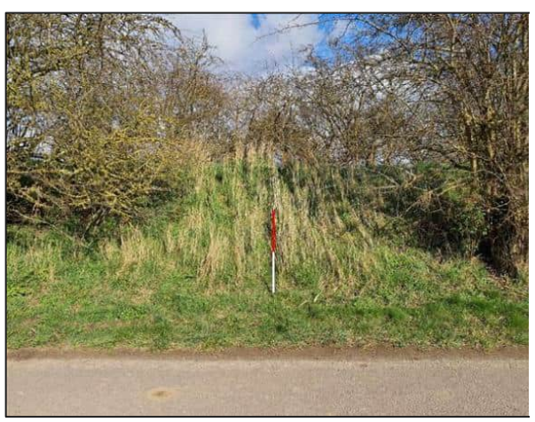
Plate 13: Sea bank at Wyberton Road (MLI97710)