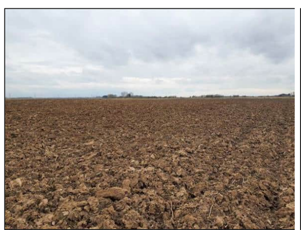
Plate 19: LiDAR feature 57