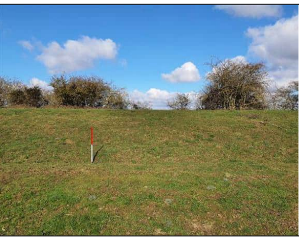
Plate 16: Sea Bank at Kirton Drain