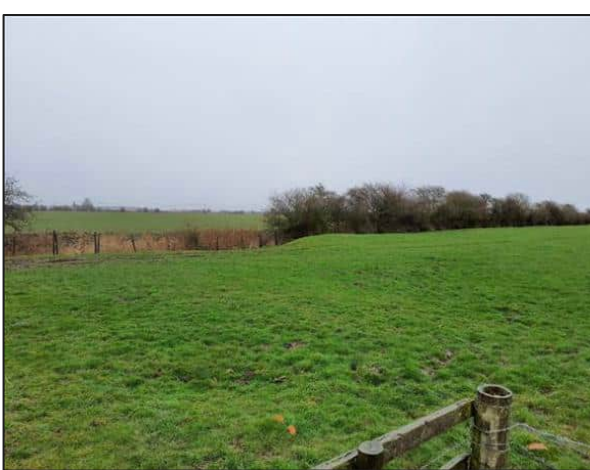
Plate 8 Earthworks at the location of Lidar feature 19