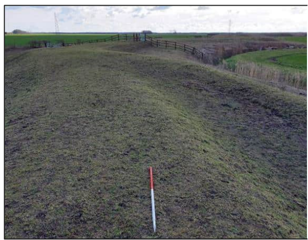
Plate 14: Section of 'Roman Bank' intersecting the segment in the south